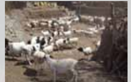
VSF G conducts De-stocking activities of small ruminants at the peak of drought crisis

VSF G has been working in Kenya since 1998 to enhance sustainable socio-economic growth and increased resilience amongst pastoralists and agro-pastoralists communities in Arid and Semi-Arid Lands (ASALs). The approach has been to improve food security and livelihoods of this vulnerable population by reducing the impact of drought and livestock diseases and encouraging them to venture into alternative livelihoods