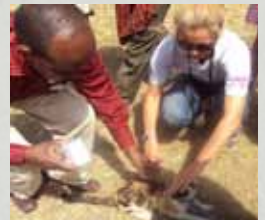
Over 10000 dogs and cats were successfully vaccinated against Rabies in Narok County in three divisions including Mara, Osupuko and Loita divisions