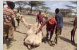
Deworming of livestock for improved animal health

VSF G has been working in Kenya since 1998 to enhance sustainable socio-economic growth and increased resilience amongst pastoralists and agro-pastoralists communities in Arid and Semi-Arid Lands (ASALs). The approach has been to improve food security and livelihoods of this vulnerable population by reducing the impact of drought and livestock diseases and encouraging them to venture into alternative livelihoods. VSF G is also playing a critical role in conflict resolution by facilitating peace talks among warring communities.