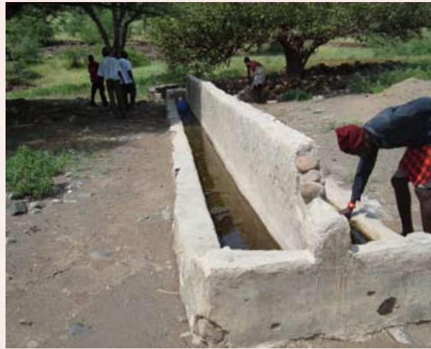
A well and trough structure constructed by VSF Germany in Illeret