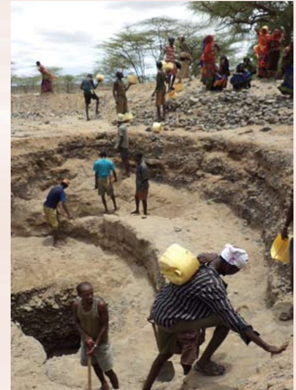
Cash for work activity in Balesea in North Horr district

The specific objective of the action is to increase sustainable access to safe drinking water, sanitation and improved hygiene practices in 11 of the most vulnerable communities in North Horr, Marsabit North and Loiyangalani district which are located northern Marsabit.