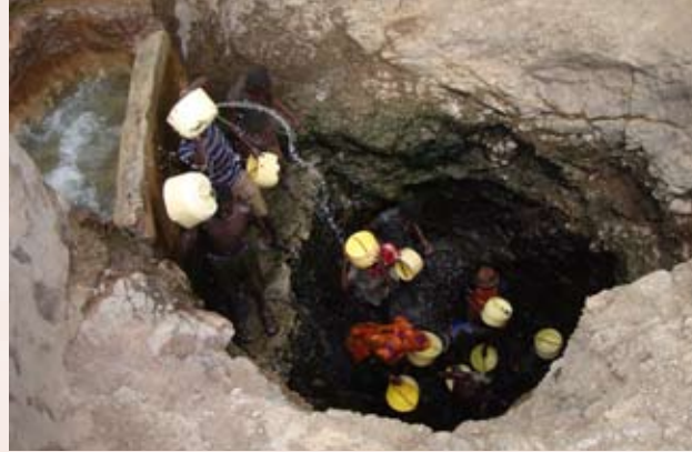
Fetching water from a well constructed by VSF-Germany in Balesaru in North Horr District

VSF-Germany is working in partnership with Solidarités International and the Pastoralist Integrated Support Program (PISP) in North Horr, Marsabit North and Loiyangalani districts in northern Marsabit. VSF-Germany has been working in Ileret, El Gade, Elhade, Balesa, Balesaru and Dukana area. The project has been implemented in close collaboration with the local authorities communities in order to guarantee its sustainability.