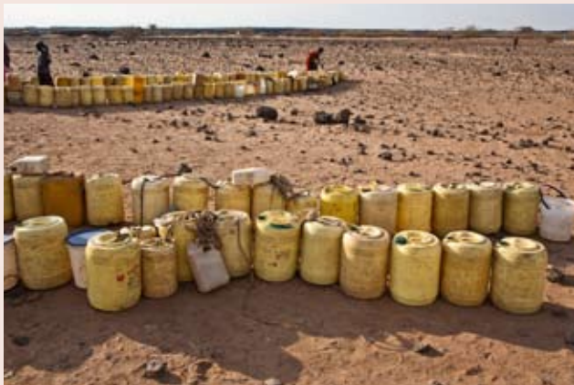
Waiting for water in North Horr district. The consortium will improve the access to water.

During the rainy season, the area is prone to outbreak of diseases such as cholera due to poor sanitation. The project is designed to improve the conditions of hygiene and sanitation for the local population.