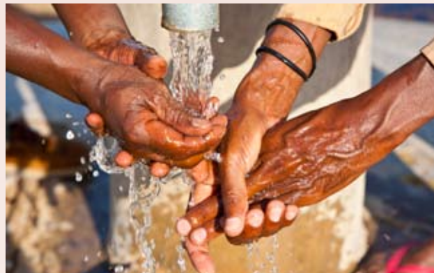
Improving hygiene practices is essential to reduce diseases such as diarrhea

VSF-Germany is working in partnership with Solidarités International and the Pastoralist Integrated Support Program (PISP) in North Horr, Marsabit North and Loiyangalani districts in northern Marsabit. VSF-Germany has been working in Ileret, El Gade, Elhade, Balesa, Balesaru and Dukana area. The project has been implemented in close collaboration with the local authorities communities in order to guarantee its sustainability.