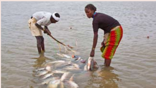
Fishing as alternative source of income

Vétérinaires Sans Frontières Germany (VSFG) Email: info@vsfg.org Website: www.vsfg.org