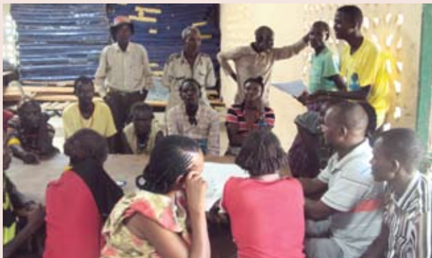
Community Managed Disaster risk Reduction (CMDRR) workshop