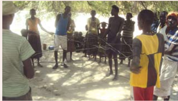
Community Managed Disaster risk Reduction (CMDRR) workshop