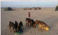
Feeding of lactating and pregnant Goats in Afar Region

economic growth and increased resilience amongst pastoralists and agro-pastoralists communities. The approach has been to improve food security and livelihoods of vulnerable population through contributing to improved animal health status, asset based community development, to enhance local capacities in veterinary and animal health interventions, peace building, conflict resolution and reconciliation, economic recovery and job creation, disaster risk reduction and response, increased resilience to shocks, strengthening community based natural resource management and asset protection among others. VSF G then expanded its implementation to Afar in 2012. Now we are in three districts of zone two (Afdera, Aba’ala and Berehale) and in 2013 we extended to two more districts of zone two ( Megale and Erebt), so in zone 2 of the Afar region VSF G implemented in 5 districts out of 7. Currently VSF G is implementing three projects in Ethiopia (one in South Omo, SNNPR) and two in Afar.