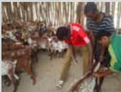
Vaccination campaign in Afar Region

Livestock plays an important economic and socio-cultural role among many Ethiopian communities. The livestock sub-sector contributes to the food and cash needs of the farmers, and provides employment to about 85%, contributes to GDP of the country. Both crop farmers and pastoralists keep livestock for food and income generation.