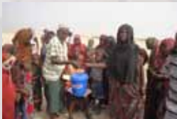
Meat distribution in drought affected Communities in Afdera