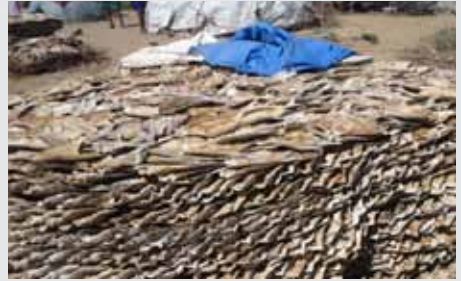
The Photo illustrates preserving fish using common salt

V SF G was officially registered in Ethiopia in 2010 after having started a partnership with the national NGO EPARDA in 2009 for a cross-border project in Marsabit / Kenya and south Omo /Ethiopia, the ECHO funded project “improved community response to drought”. VSF G is now registered as a foreign charity and started own project implementations in SNNPR (Southern Nations, Nationalities, and Peoples’ Region) in two woredas (=counties) of the south Omo Zone, Hamer and Dassenech. VSF G aims at enhancing sustainable socio-