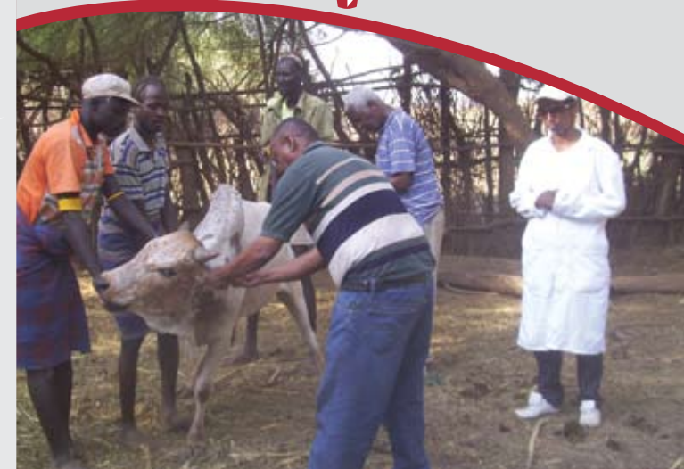
Improved Community Response to Drought III (ICRD III) in South Omo Zone, Ethiopia