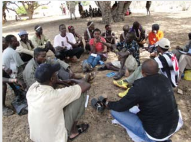
Field training, after the Training of Trainers (TOT) and Community Managed Disaster Risk Reduction (CMDRR) training.

The aim of the project is to improve the welfare of this vulnerable people through improving their coping strategies to recurrent drought strategies by improving animal health and production, supporting livelihood diversification and income generating activities.