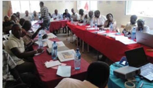
Training of Trainers (TOT) training at Jinka.