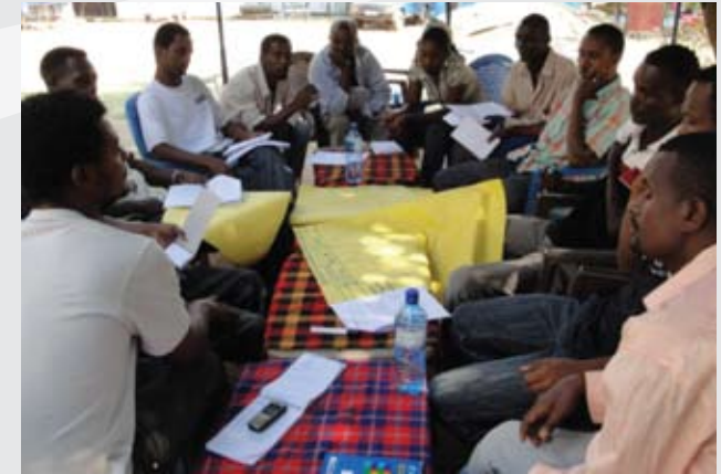
Training of Trainers (TOT) training at Jinka.