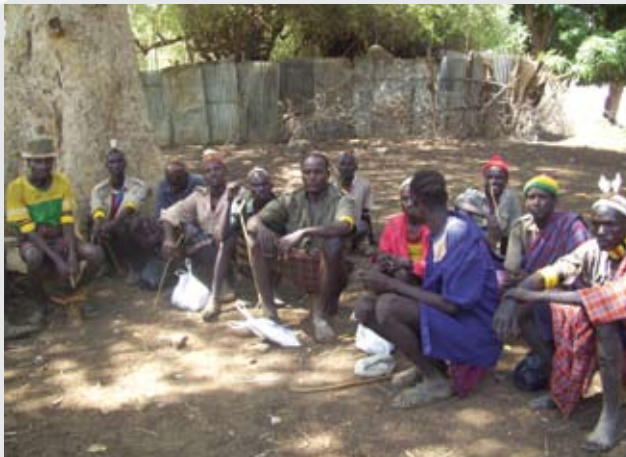
Participants of the Community Animal Health Workers (CAHWs) training.