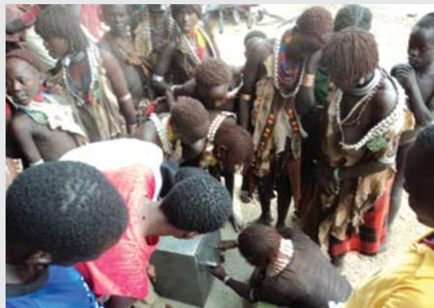
New safe box for VICOBA group