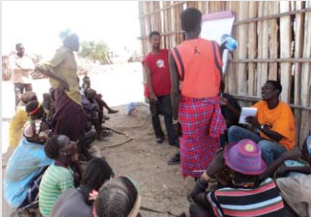
Participatory Disaster Risk Analysis (PDRA) training.

The project seeks to mobilize and enable pastoralist communities to build their own knowledge, use their existing assets more effectively and increase capacities to face future hazards.