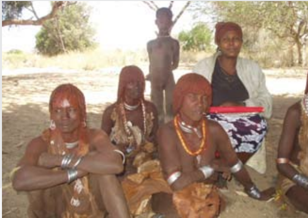
Village Communal Banking Groups VICOBA Group in Minongelti.

This project is funded by ECHO under the: Reference: ECHO/-HF/BUD/2010/01011